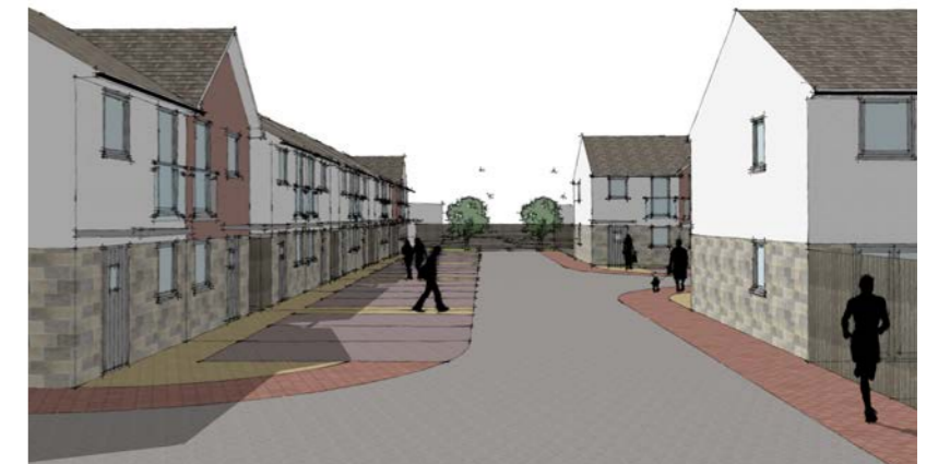
04 - VIEW FROM SITE ENTRANCE