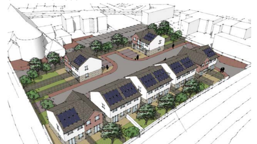
02 - VIEW FROM SOUTH WEST