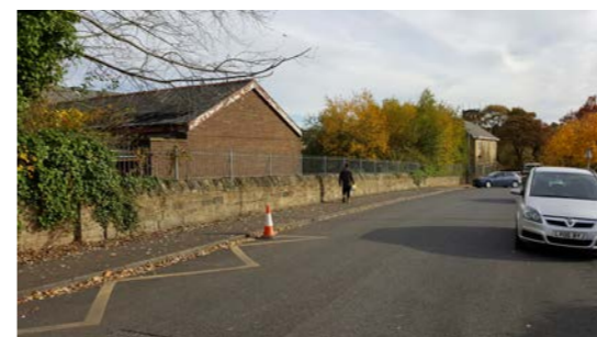
EXISTING SITE PHOTOGRAPHS - VIEWS ALONG NORTH BANK ROAD