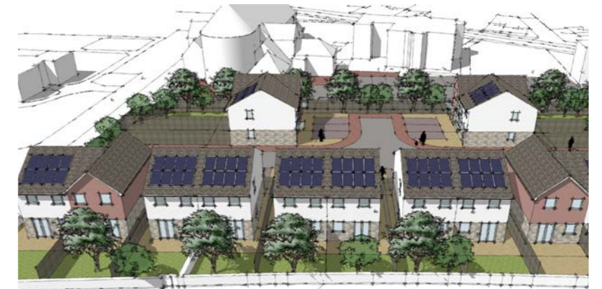
01 - VIEW FROM SOUTH