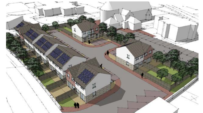
03 - VIEW FROM SOUTH EAST